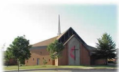
St. Luke United Methodist Church